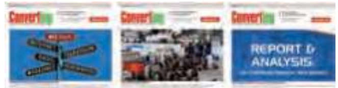
Some examples of the Converting newsletter, in the Italian and English versions.